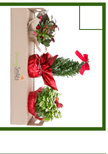
Table Top Trio

A Holiday Wreath is a classic door upgrade. Fresh noble, cedar and juniper decorated with a large plaid bow, frosted pine cones and red berries are sure to give you and your guests a homey warm feeling from the outside.