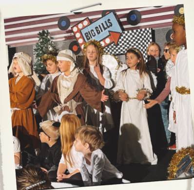
HCS Choir Angels, Shepherds & Sheep