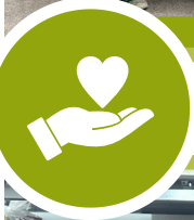
Donating all the PB & J to The Vault. Thank you to everyone who donated.