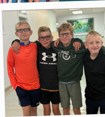
Friends Together Again