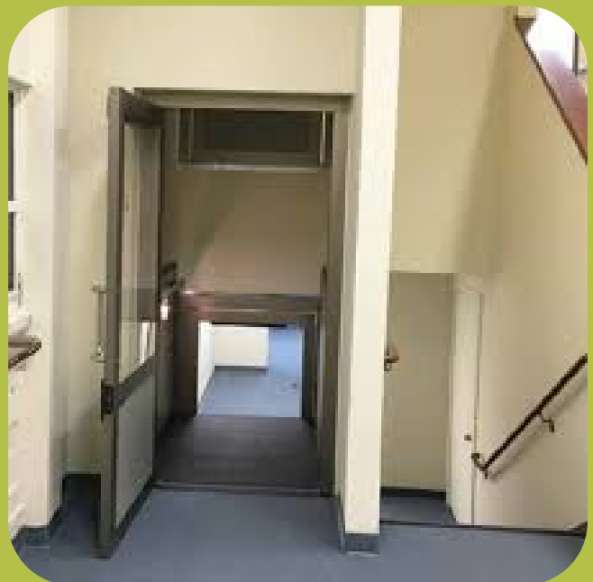
Image of a platform lift similar to the one being installed at our school.